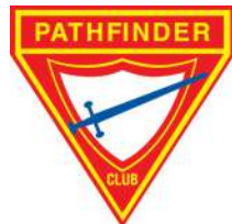
Pathfinders 10 - 15 Years