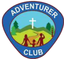
Adventurers 04 - 09 Years