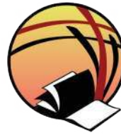
Ambassadors 16 - 21 Years