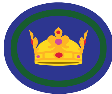
CLASS EXPLORER Bible Discovery III