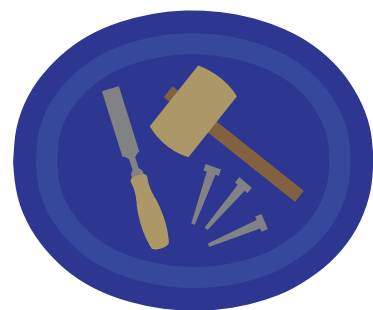
CLASS FRIEND His Life