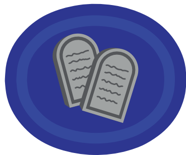
CLASS FRIEND Bible Discovery I

Genesis-Ruth Patriarchs & Prophets Pentateuch-Pre Monarchy