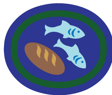
CLASS EXPLORER His Miracles