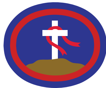
CLASS COMPANION Bible Discovery II

Genesis-Ruth Patriarchs & Prophets Pentateuch-Pre Monarchy