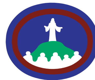
CLASS VOYAGER His Teachings