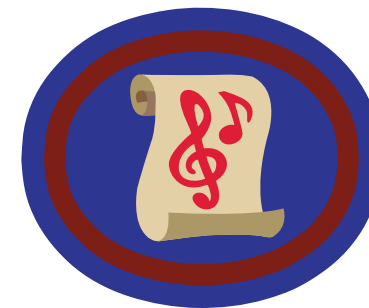
CLASS VOYAGER Bible Discovery V

Acts-Jude Acts of the Apostles Apostolic Church