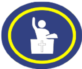
Christian Art of Preaching