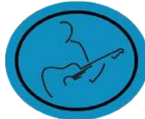
Guitar & Advanced