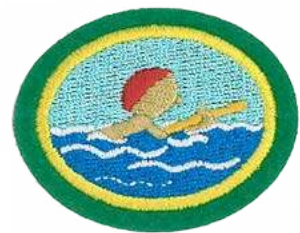
Basic Water Safety

"Eight hours' work, eight hours' sleep, and eight hours' recreation." —Brigham Young