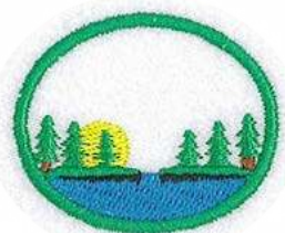
Bogs and Fen