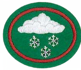
Cold Weather Survival