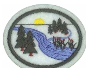
Rivers and Streams