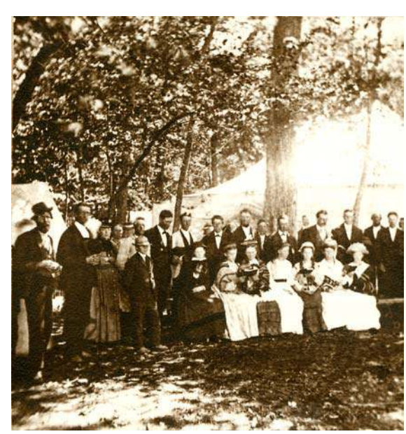
Scenes at a campmeeting at Eagle Lake, Wisconsin