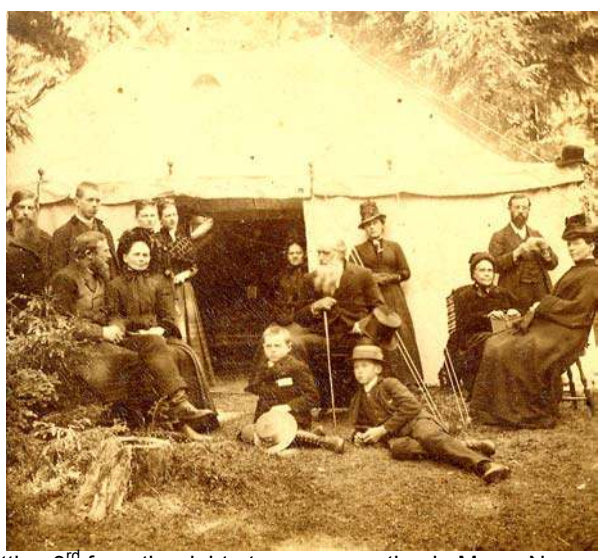
E.G. White sitting 3<sup>rd</sup> from the right at a campmeeting in Moss, Norway (June 1887)

A course in Church History highlighting significant details of interest to the youth of the Seventh-day Adventist Church