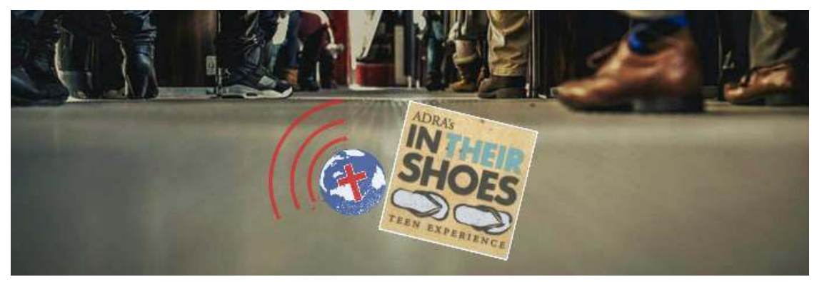
Global Youth Day is set to launch the official week of the Youth Week of Prayer meetings.